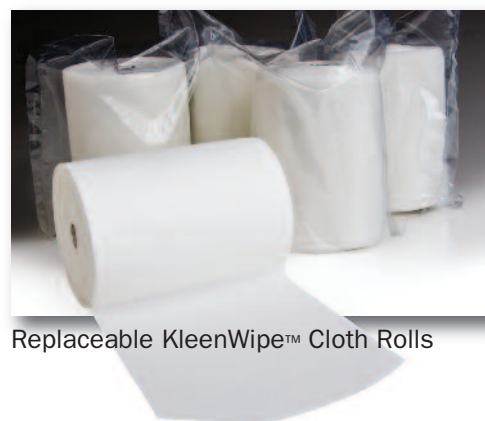
Replaceable KleenWipe™ Cloth Rolls